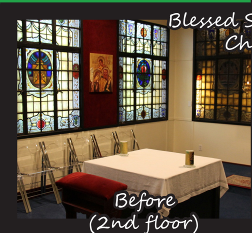
Before (2nd floor)