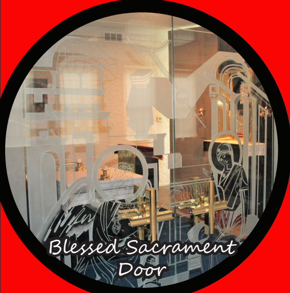
Blessed Sacrament Door

"Beauty will save the world" -Fyodor Dostoevsky